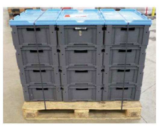
3 layer stack = 12 SLCs