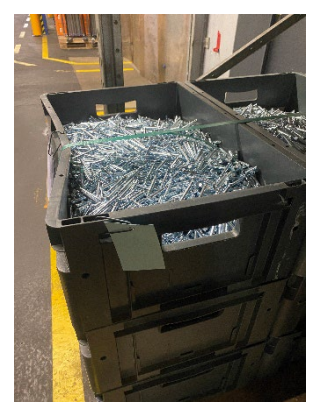
Risk of white breakage

Plastic crates with stress whitening must be taken out of service and delivered separately to SIMONSWERK. When lashing SLCs, a lid or adequate edge protection must be placed over the top layer to prevent deformation and stress whitening of the SLCs. Containers damaged by incorrect transport protection will be charged to the supplier.