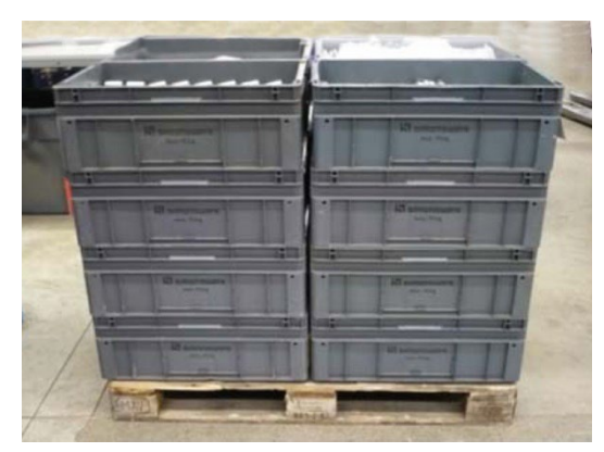
4 layer stack = 16 SLCs

SLCs with a footprint of 610x400mm are to be stacked on a euro pallet with a quantity of 4 pcs per layer and 4 pcs high. The maximum quantity per pallet in this case is 16 containers. The maximum weight per SLC of 75 kg and per total pallet (1,000 kg) must be adhered to. Should the total permissible weight of a pallet already be reached or exceeded with a quantity of 12 SLCs, then the SLCs must be stacked crosswise to the footprint (3 pcs on the footprint, 4 pcs high)