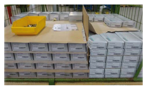
Mixed pallet with strong cardboard dividers